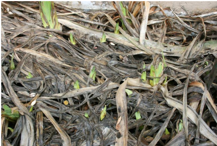
The green iris sprouts signify that Spring is soon coming. Incidental