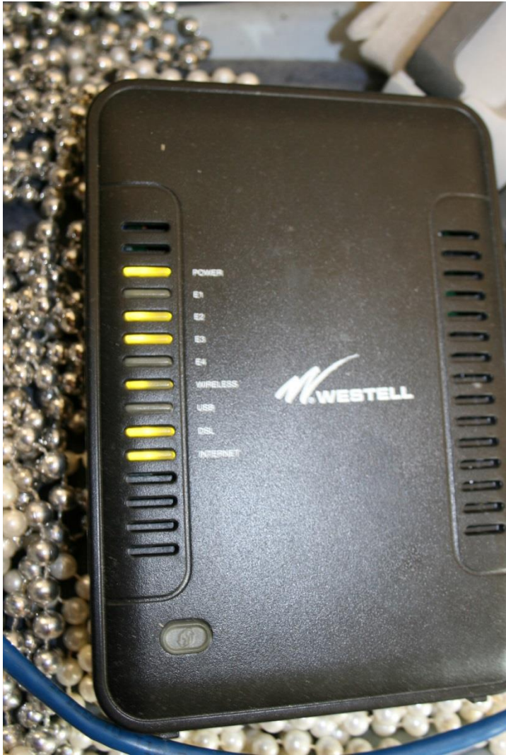
The green lights on the router signify that it is working. Incidental, digital