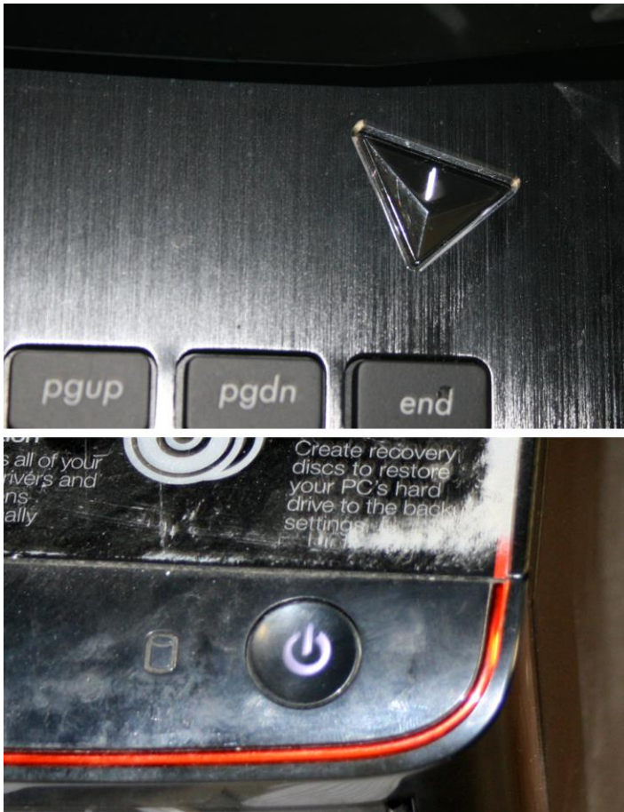
The lights on the computer signify if it is “on”. Planned, digital