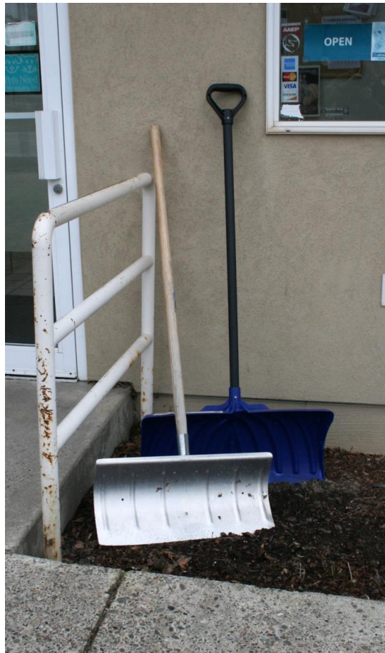
The shovels signify that it is, has or will be snowing. Incidental